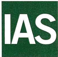
King Cert International Certification Ltd. Director

ACCREDITED Management Systems Certification Body MSCB-196