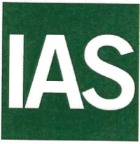
King Cert International Certification Ltd. Director

ACCREDITED Management Systems Certification Body MSCB-196