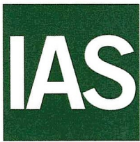
King Cert International Certification Ltd. Director

ACCREDITED Management Systems Certification Body MSCB-196